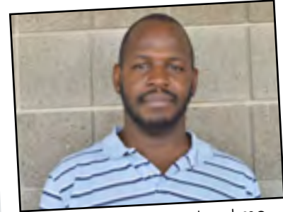
My math professor helped me overcome my fear of math by teaching me different ways to solve equations.

VVC Rams look to build momentum during their 2015 football season.