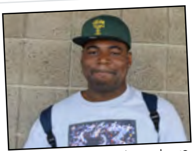
My fire technology classes have taught me to think outside the box.